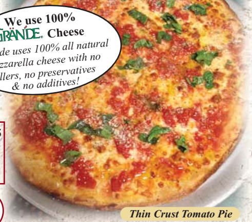
Thin Crust Tomato Pie

We use 100% GRANDE Cheese Grande uses 100% all natural mozzarella cheese with no fillers, no preservatives & no additives!