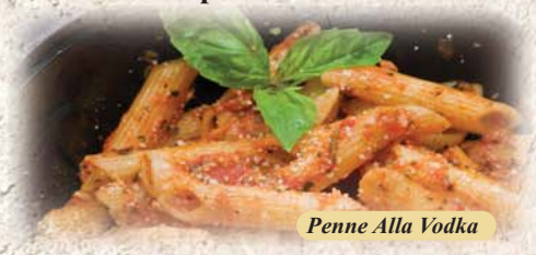
Penne Alla Vodka